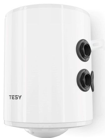
30 L Slim