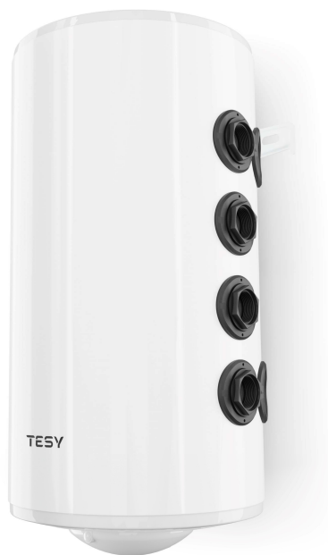
50 L Slim